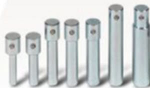
A-5600 Set of punches. Optional.

* Cylinders have a greater capacity than punches or V-blocks. A well balanced distribution of pressure on V-blocks is compulsory.