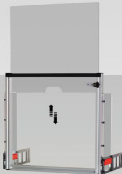
Press protection. Two models [See next page]